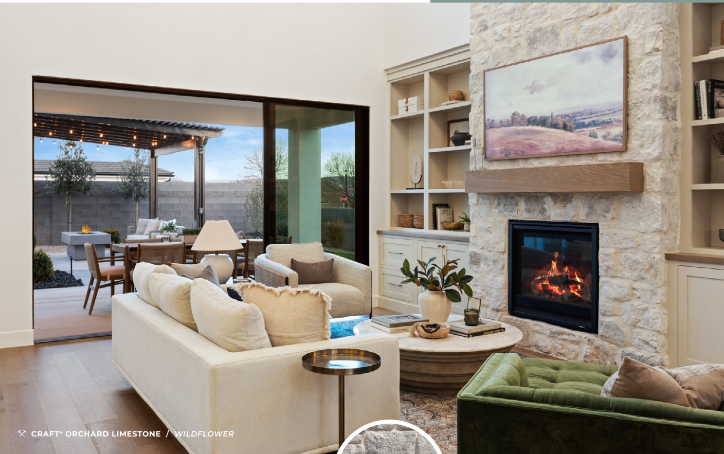
CRAFT® ORCHARD LIMESTONE / WILDFLOWER

▲ With our stone veneer's incredible color retention, you can ensure that your Creative Mines fireplace design will impress for years to come.