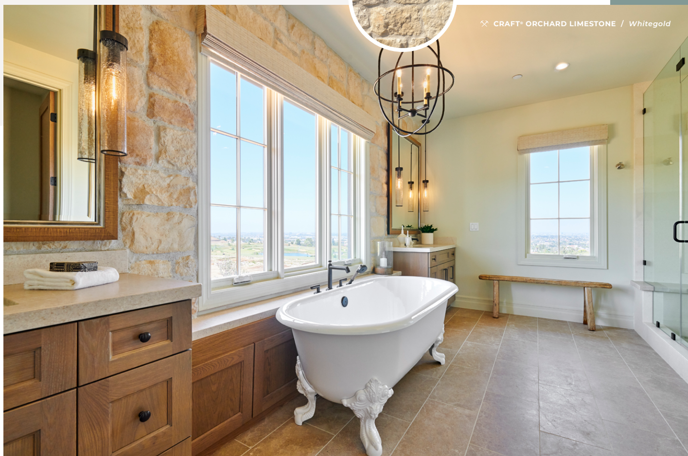
✕ CRAFT® ORCHARD LIMESTONE / Whitegold

Bring peace and tranquility to your bathroom design with Creative Mines stone veneer. ▲